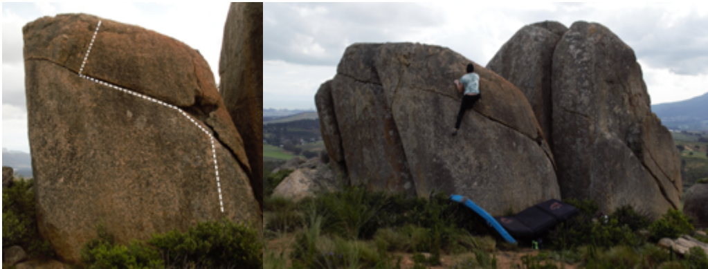
Photo 4. From Rusk Till Dawn